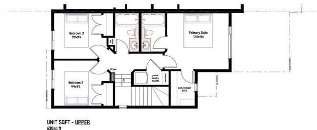
UNIT SQFT - UPPER 630sq ft